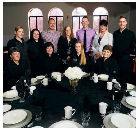
Partner: Grand Gardens